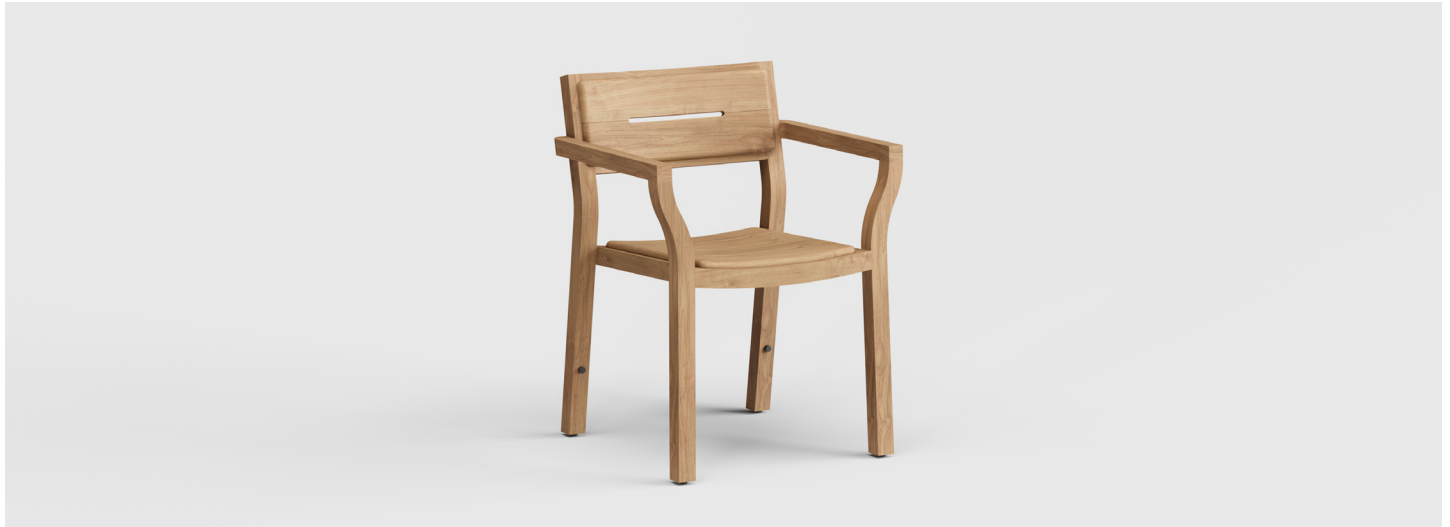
DINING ARM CHAIR STACKABLE