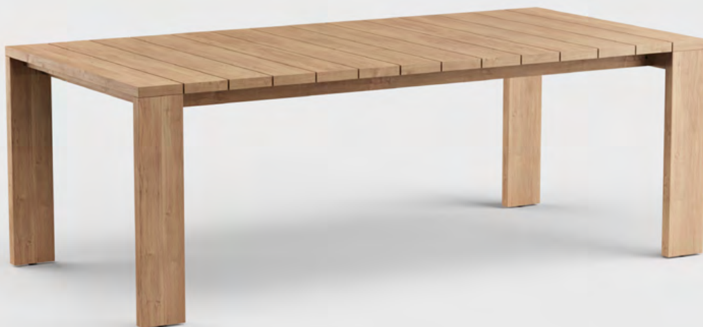
RECT DINING TABLE 84"