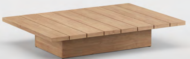
RECT COFFEE TABLE 51"