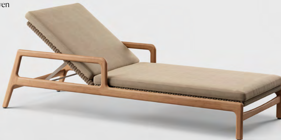
ARM CHAISE TEAK