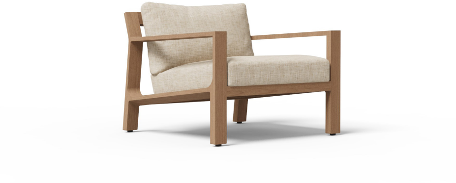
LOUNGE CHAIR TEAK